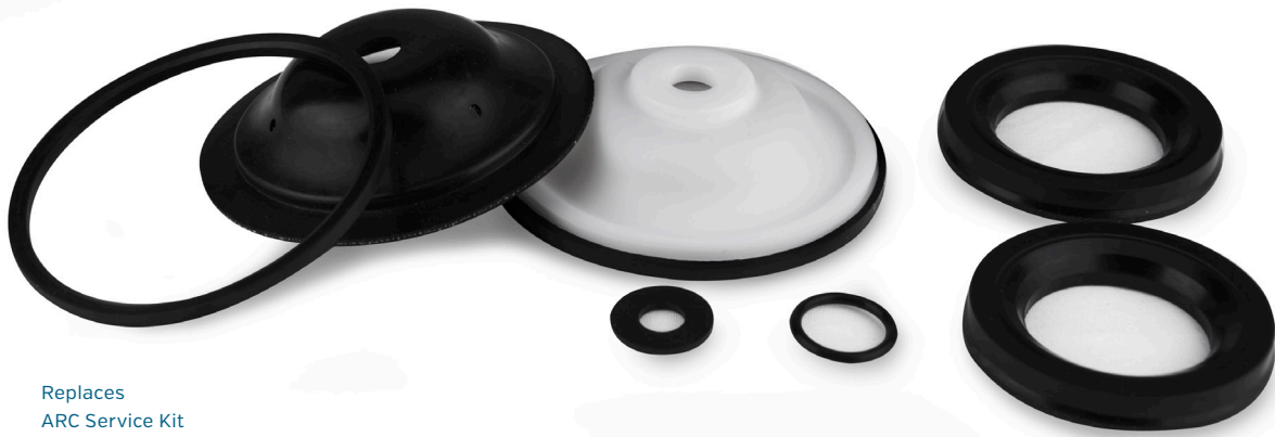
Replaces ARC Service Kit

With a wide variety of Flowtrend manufactured wear parts for all major OEM suppliers' sanitary products. Flowtrend offers an impressive line-up of replacement parts—all available, in stock and ready to ship the same day, reducing downtime and maintenance costs. Backed by an unconditional quality guarantee and at a fraction of name-brand prices, our products free you from dependence on the original manufacturer and its prices for replacements and repairs.