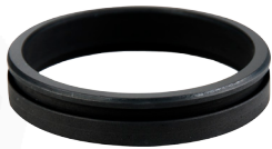
Replaces Votator Seal Body Insert