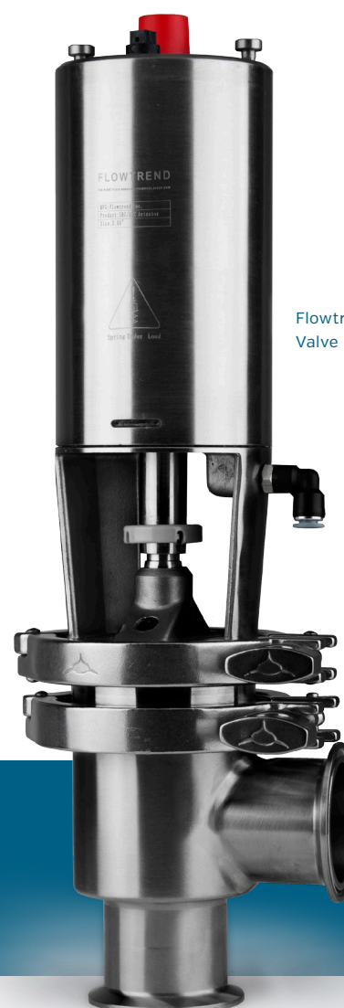
Flowtrend ARC-R Valve

Flowtrend® is the manufacturer of these OEM replacement parts. Flowtrend® is not sponsored by, affiliated with, connected with, and does not represent or otherwise have any endorsement from the OEM manufacturers. Any name, model, part number, brand, image, material, or referral is for descriptive purposes only. Flowtrend's parts or products are not Alfa Laval parts or products, and Alfa Laval does not endorse, approve or warrant Flowtrend's parts or products or their use.