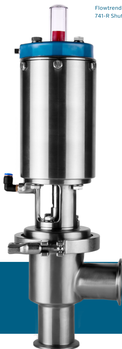
Flowtrend 761-R/Flowtrend 741-R Shut-off Valve

Flowtrend has a diverse line of valves to accommodate a variety of operating conditions found in the sanitary industry. From the Flowtrend ARC-R Seat Valve that is well suited for aseptic conditions and high sterilization temperatures, to the Flowtrend 761-R/Flowtrend 741-R available in both divert and shut off, with an easily repairable actuator, Flowtrend offers a full line of high quality valves intended to be interchangeable with the OEM products.