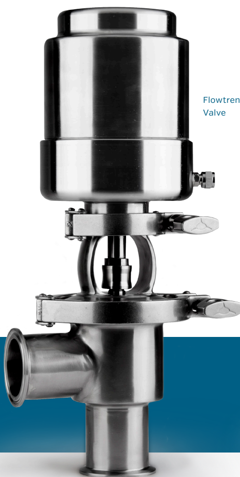
Flowtrend 361-R Valve