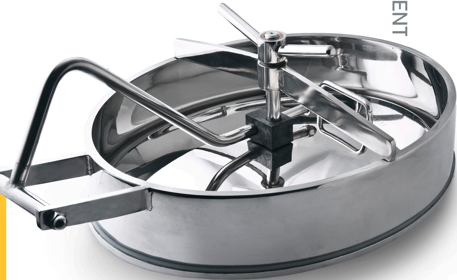
Flowtrend Oval Manway

Flowtrend's tank equipment line offers a comprehensive list of high-quality replacement parts and cleaning heads.