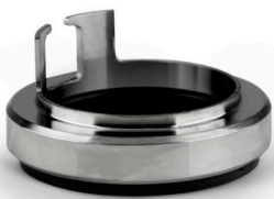
Replaces Contherm Rotary Seal

With a wide variety of Flowtrend manufactured wear parts for all major OEM suppliers' sanitary products. Flowtrend offers an impressive line-up of replacement parts—all available, in stock and ready to ship the same day, reducing downtime and maintenance costs. Backed by an unconditional quality guarantee and at a fraction of name-brand prices, our products free you from dependence on the original manufacturer and its prices for replacements and repairs.