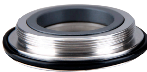
Replaces LKH 5-60 Pump Seal, Stationary & Rotary